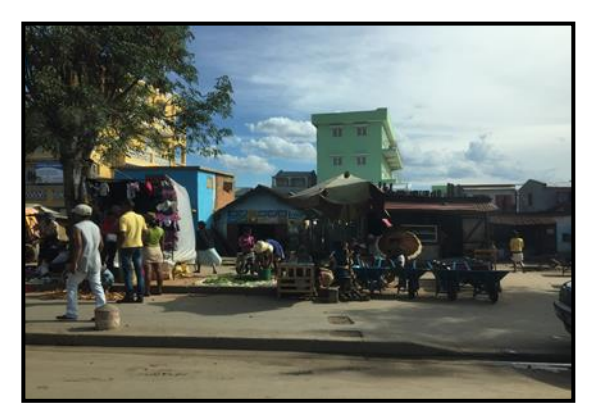
Picture 1: People coming and going give off an impression of Asian influence

Indeed, as you enter the capital city of Antananarivo the atmosphere of the people living there gives off the distinct impression of Asian influence. In fact, just on leaving the airport and after a few miles all the rice paddy fields already give you a feeling of being in Asia (picture 2).