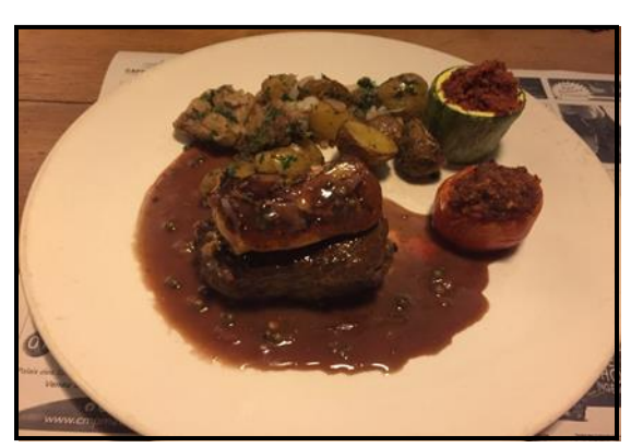
Picture 4: Zebu steak Rossini (medallion of steak, a price of less than ¥1,000 is hard to imagine in Japan