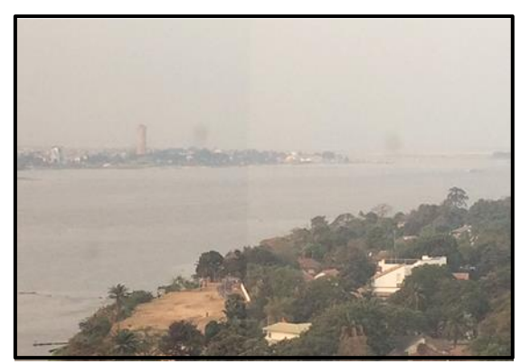
Picture 1: Brazzaville (opposite shore) as seen from Kinshasa (front

Republic of the Congo is Brazzaville, which is just a stone's throw away on the other side of the river both are located on and it takes only about 15 minutes by boat between them (picture 1).