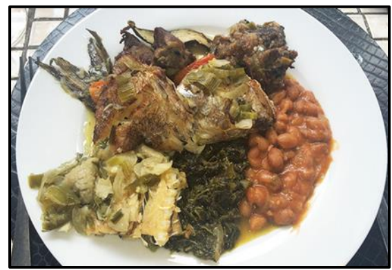
Picture 5: Clockwise from bottom; pondu, grilled fish (2 types), grilled beef, and beans

The history of the DRC has been chaotic to say the least. During the 19th century King Leopold II of Belgium became interested in exploring the Congo River basin region and sponsored the explorer Sir Henry Stanley to carry out the exploration of areas he designated. As a result, at the Conference of Berlin in 1885, King Leopold formally acquired the rights to this territory as his private property and named it the Congo Free State. Abundant amounts of natural rubber were soon found in the Congo Free State resulting in the ejection of the residents from their land in order to harvest the rubber. However, due to growing international criticism of the brutality and inhumane treatment in the Congo Free State under Leopold's rule, he sold the territory to Belgium in 1908. The territory thus became a colony under the control of the Belgium government and renamed Belgian Congo.