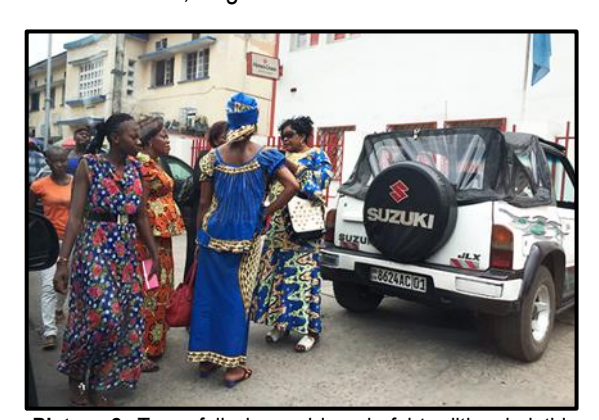
Picture 2: Townsfolk dressed in colorful traditional clothing and a used Japanese auto standout in this picture

The DRC was a former Belgian colony and as such French has become the official language, while four major dialects, Swahili in the eastern region of the country, Kikongo in the south, Lingala in the west and Tshiluba in the central part of the country are also widely used. Please note that with the exception of hotels, various international institutions and high-ranking government officials, English use is not common.