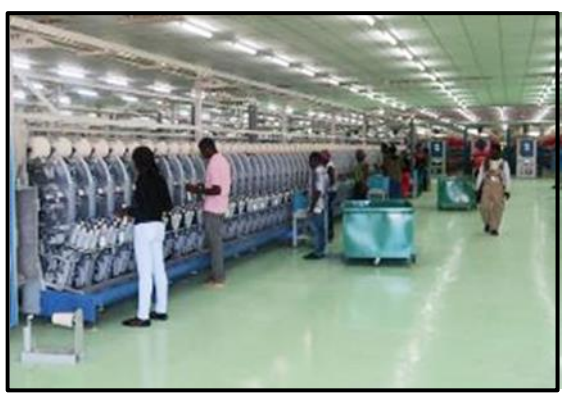
Picture 5: Textile plant rehabilitation phase II (towel and sheet spinning zone)

There are a number of reasons for the high prices, which I referred to at the beginning of this article, in Angola. The first is Angola's nearly 30-year civil war (see below) which left Angola's domestic industry in ruins and undeveloped, resulting in an economy that is still overly dependent on imports even for many of the basic necessities of life, including daily food items. The second reason is the high transport costs due to a lack of transportation infrastructure. And third is the accelerating influx of capital and people accompanying Angola's rapidly progressing oil development.