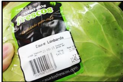
Picture 2: One head of cabbage for 1,145 kwanza (≒1,300 yen or $10.40)

In order for the Marubeni Research Institute to acquire live information from the field and contribute to the Company's strategy, young Marubeni staff well-versed in economic and industry analysis have been posted to the region.