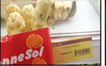
Picture 1: One bunch of asparagus for 5,050 kwanza ( \Rightarrow 5,500 yen or $46)

One bunch of asparagus for 5,500 yen ($46)! One head of cabbage for 1,300 yen ($10.40)! One notebook for 500 yen ($4.10)! You may have heard rumors that prices are high in Angola; however, it is really hits you if you see them with your own eyes (pictures 1, 2 and 3).