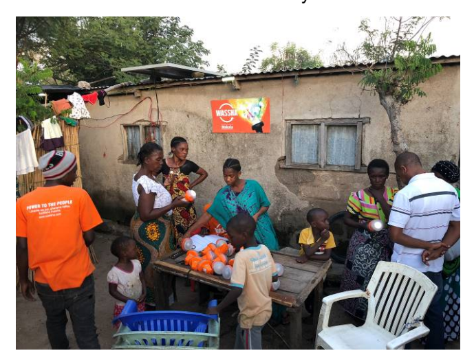
This Kiosk is seen lending Lanterns to members of the community