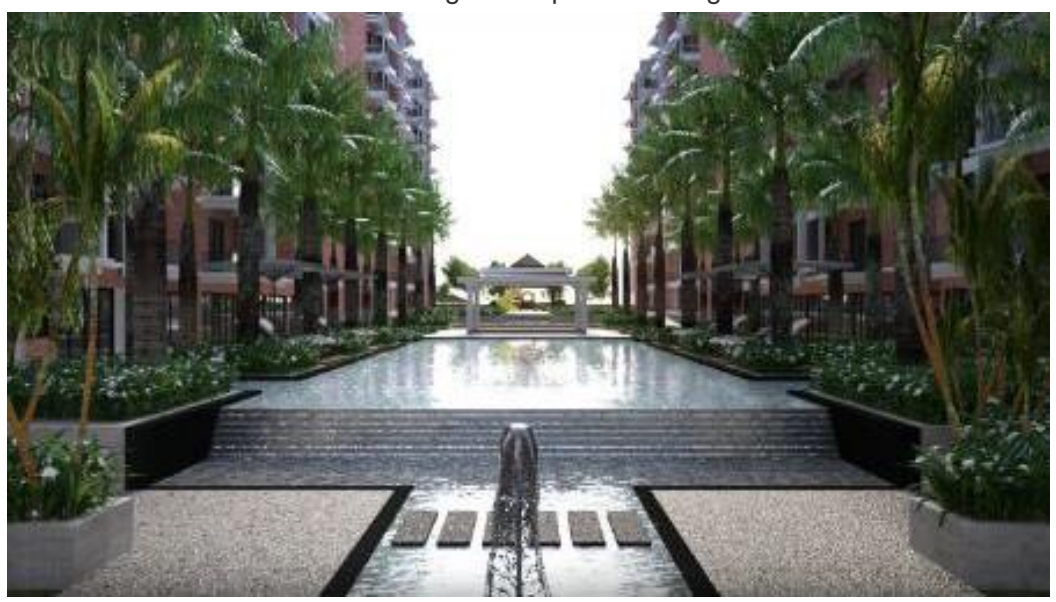
< Rendering of Completed Building >