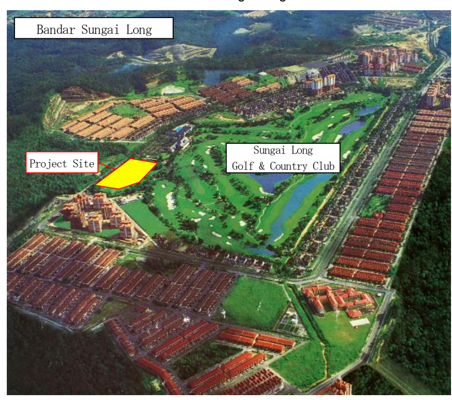
<Bandar Sungai Long>

Business Activities: General real-estate business, construction and manufacture of building materials