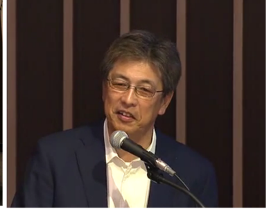
Left: Group CEOs