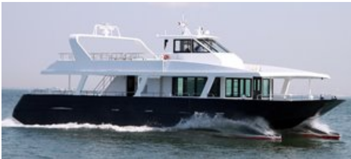
※Tryangle-owned small passenger boat.