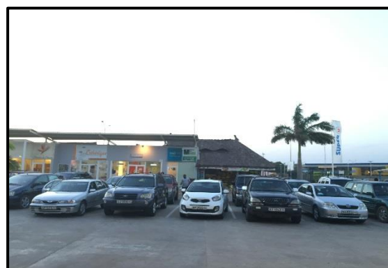
Picture 6: A parking lot at a Super U-type shopping complex. There is also a Swatch store in the complex.

Compared to Togo, Benin has many more large buildings too, and although there is not much difference in the per capita