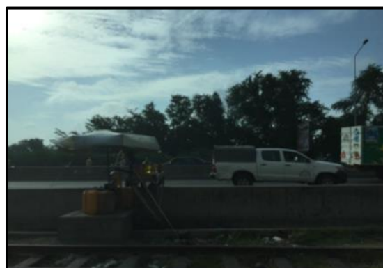
Picture 4: Gasoline (brown liquid in the container) being sold along the roadside

Another distinguishing feature of Benin's economy is its very substantial links with the Nigerian economy. With such a large African economic power neighbored in the east, Benin's eastern border is heavy with the traffic of people and goods and the circulation of Nigeria's currency the naira. One noticeable activity that has emerged from this connection to Nigeria is the smuggling of gasoline. Along the side of the roads while traveling in Benin you can see containers of brown liquid being sold. This is mostly gasoline and diesel fuel smuggled from Nigeria. And, although the government has been trying to regulate and control the smuggling of gasoline, there is an overwhelming shortage of gasoline stations in Benin which has created strong dissatisfaction among the public, so the current situation has been allowed to stand (note 5) (picture 4).